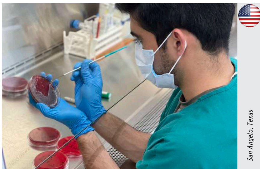
San Angelo, Texas