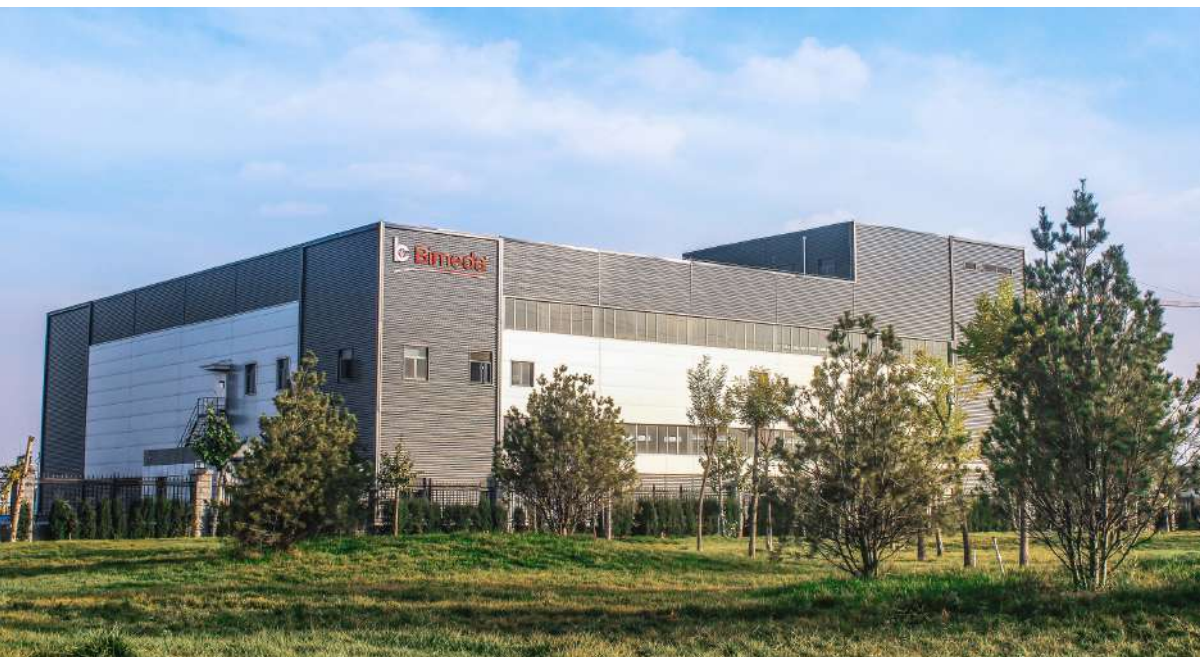
Bimeda Facility in Shijiazhuang, Hebei, China