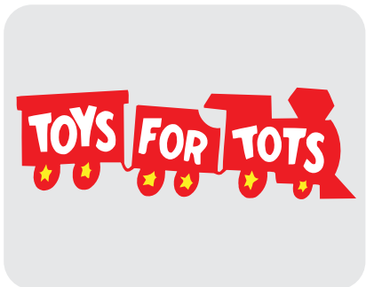
Hosting Our Toys For Tots Drive