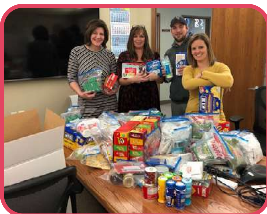
Holiday Care Packages For Our Troops Overseas!