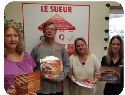
Le Sueur Pie Baking Contest!