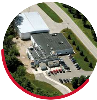
Le Sueur, MN