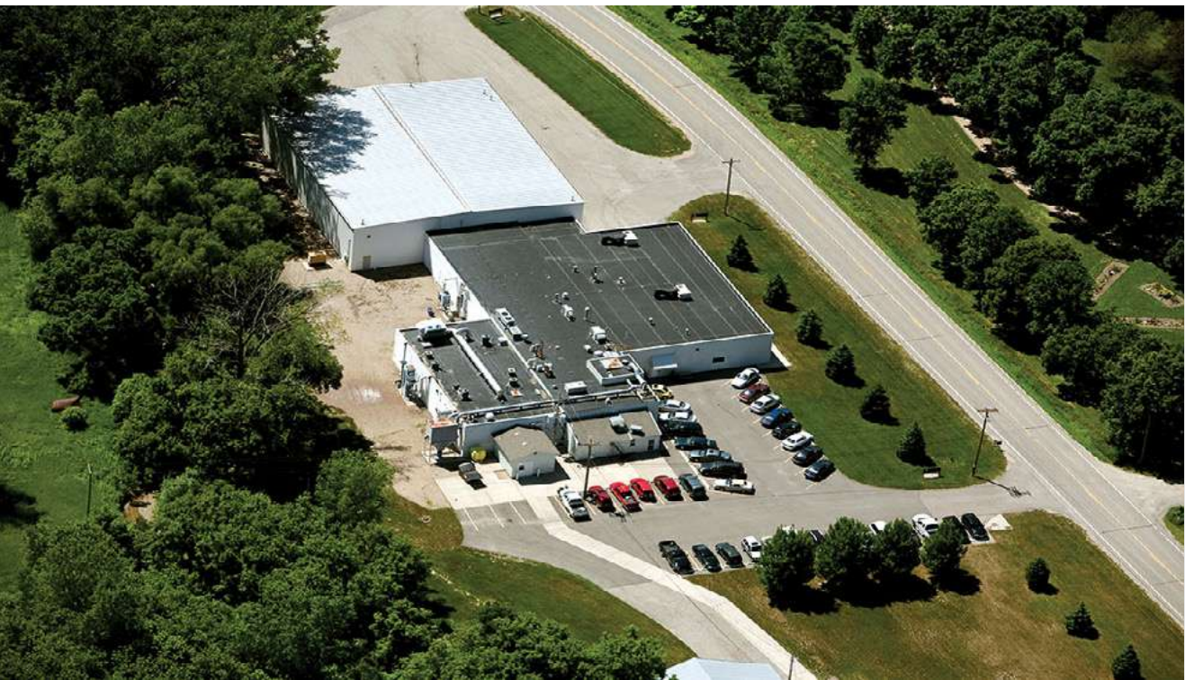
Bimeda, Le Sueur, Minnesota