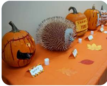
Pumpkin Carving Contest