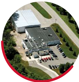
Le Sueur, MN