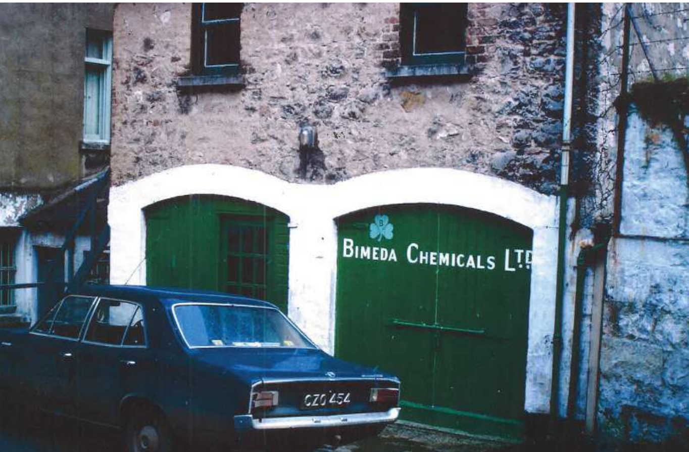
The original premises of Bimeda Chemicals Ltd in Phibsboro, Dublin, Ireland