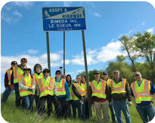
Adopt A Highway Initiative

Here's a few examples of the many great community activities that you could get involved with as an employee at Bimeda Le Sueur!