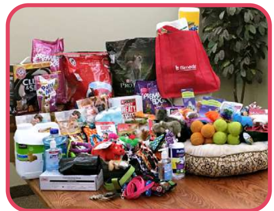
Our Doggy Drive, Supporting a Local Animal Shelter