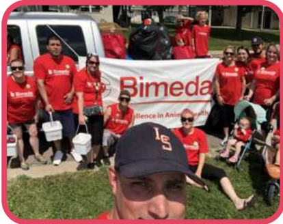
Giants Day Parade