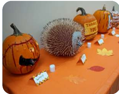
Pumpkin Carving Contest