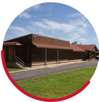
San Angelo, TX