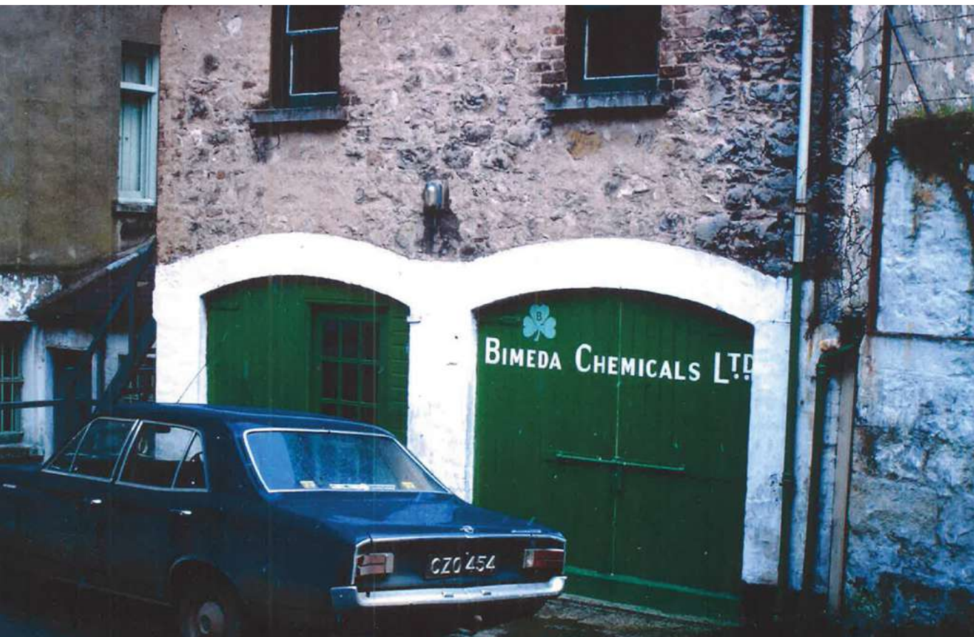
The original premises of Bimeda Chemicals Ltd in Phibsboro, Dublin, Ireland