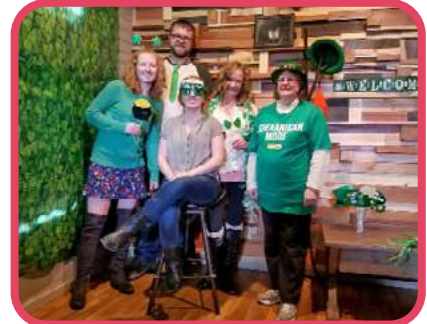
Celebrating Bimeda's Irish Heritage With a St Patrick's Day Bash