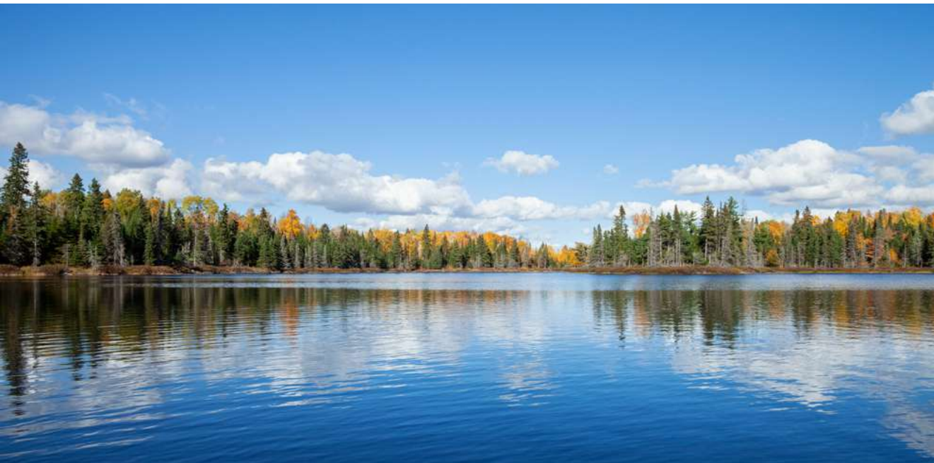
Lake Washington, Minnesota