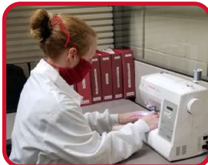
Sewing Protective Masks For Colleagues