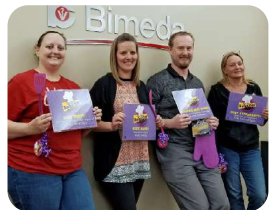
Baking Competitions With Proceeds To Our Local Food Shelf