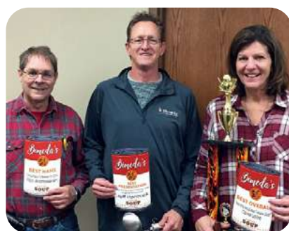
Cooking Competitions With Proceeds To Our Local Food Shelf