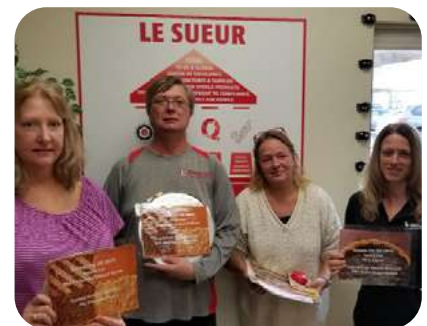
Le Sueur Pie Baking Contest!