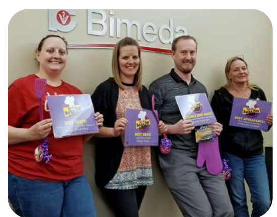
Baking Competitions With Proceeds To Our Local Food Shelf