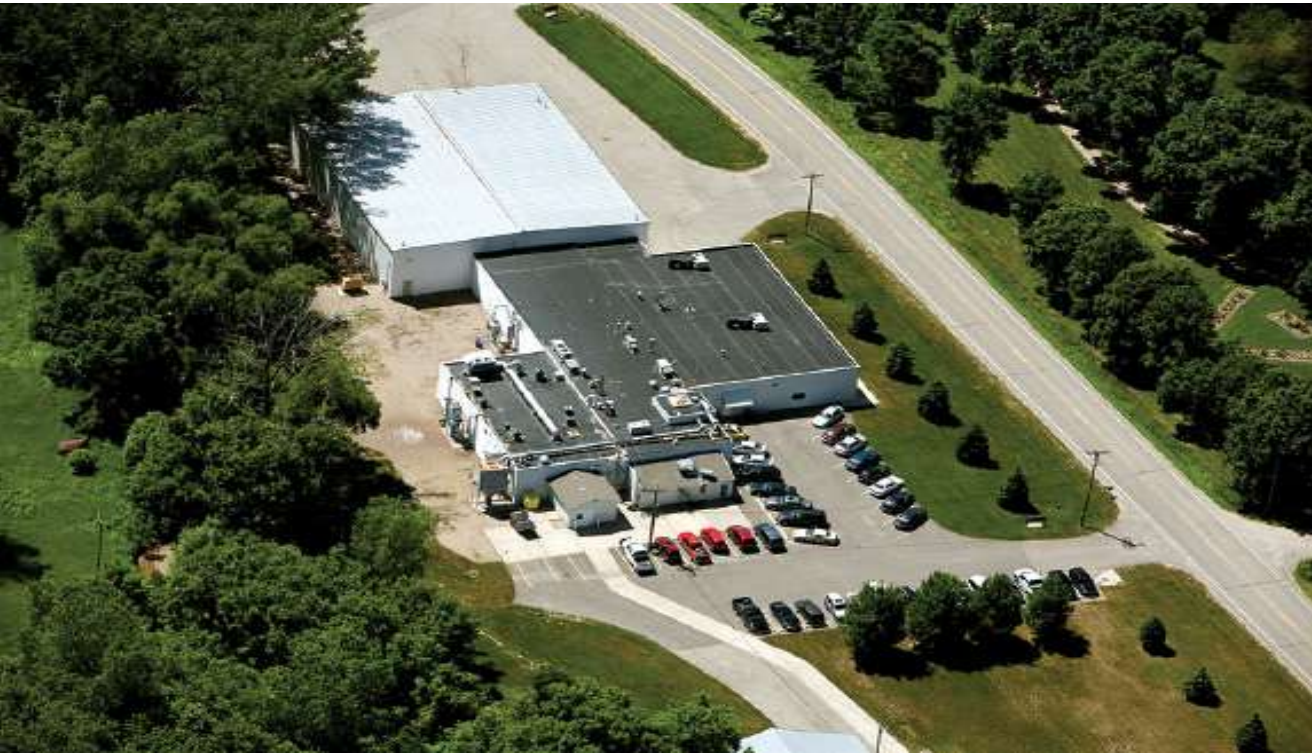
Bimeda, Le Sueur, Minnesota