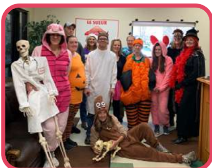
Employee Initiative: Halloween dress up