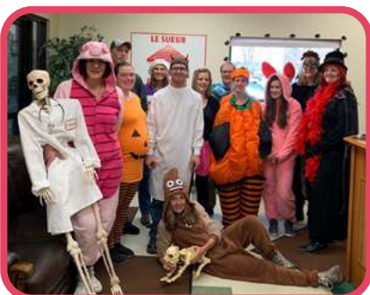
Employee Initiative: Halloween dress up