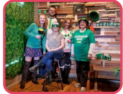
Celebrating Bimeda's Irish Heritage With a St Patrick's Day Bash