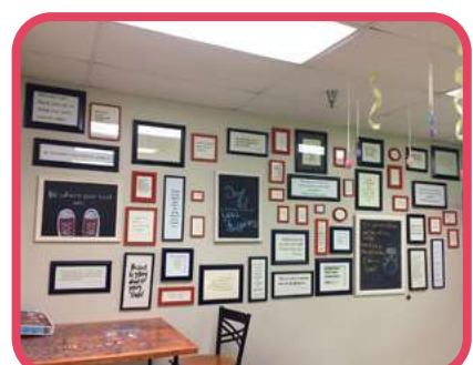
Employee Breakroom Makeover Project!